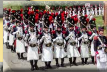
Sappers (combat engineers)