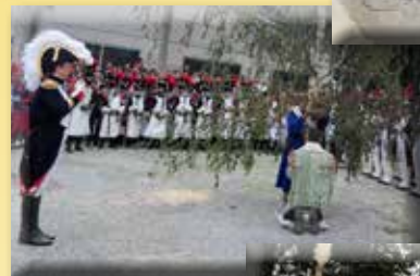
Lord of Walcourt imploring The Virgin at the Jardinnet