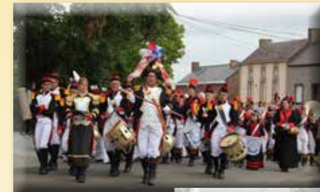
Fifes, drums and marching band

Since more than 50 years, the "Volontaires Réunis" from Ham-sur-Heure are part of the celebrations as well.